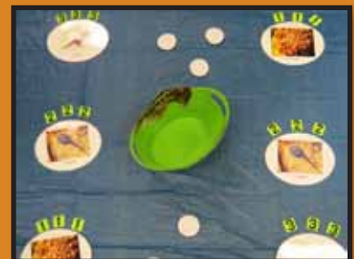
Frog Life Cycle Bean Bag Toss $10

Encourage the children to toss the bean bags and collect the tokens from each stage in a frog's life cycle. Once they have collected one of each of the tokens, the children toss their bean bags into the frog bucket. This activity will enhance the children's gross motor and turn-taking skills.