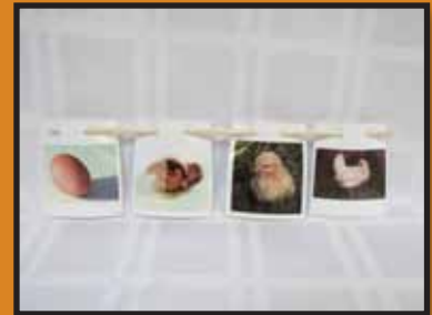
Life Cycle of a Chicken Sequencing Game $3

Children use math and science skills such as sequencing, probability, and hypothesis when they determine the chicken life cycle. As they thread the cards onto the wooden dowel, fine motor skills such as hand-eye coordination and lacing are encouraged.