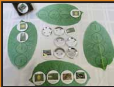
Caterpillar Concentration $12

As the children flip over the game discs to complete the butterfly life cycle, a variety of learning skills are enhanced. Turn-taking provides opportunities for social skill development and seriating the life cycle offers opportunities to develop numeracy and science skills.