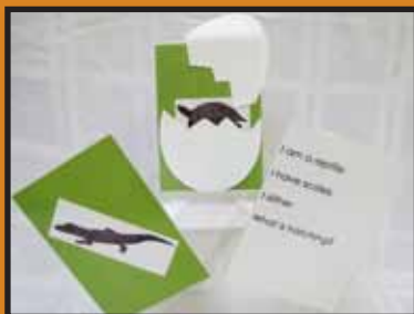
What's Hatching Guessing Game $5

Children are prompted by clue questions on the back of the cards which encourage them to use a variety of skills such as problem solving, connecting, and listening for the purpose of responding with scientific predictions.