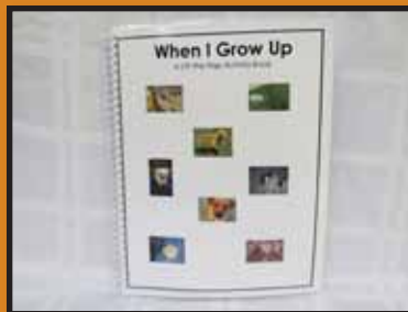
When I Grow Up Lift-the-Flap Activity Book $15

Children use science knowledge to make predictions about what animal the baby will be when it grows up. Language and literacy skills are encouraged by offering children the choice to record their predictions. Other skill enhancement opportunities include: book conventions, observation skills, reflection skills, and communication.