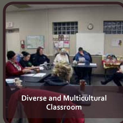
Diverse and Multicultural Classroom