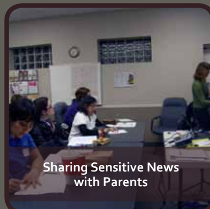
Sharing Sensitive News with Parents