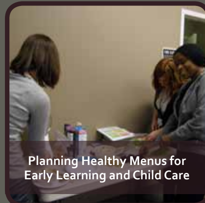
Planning Healthy Menus for Early Learning and Child Care