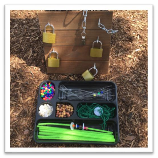
Supporting Children's Fine Motor Experiences