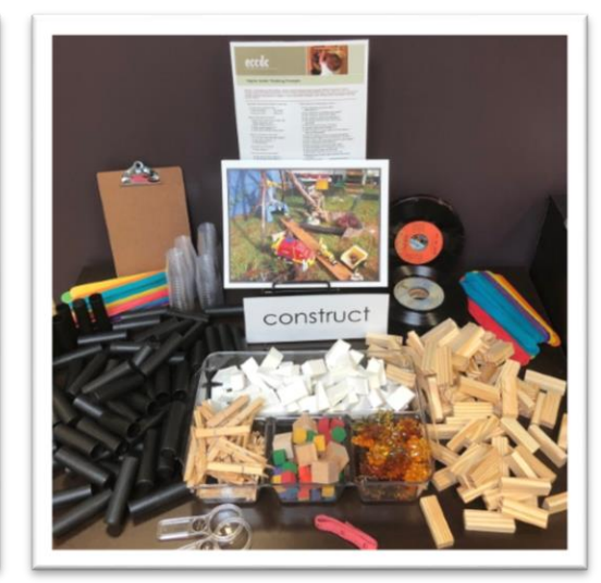
Exploring Loose Parts with Preschoolers Catalogue ID: BOX.0508.00, # 6491

Loose Parts Play Catalogue ID: OUT.0064.00, # 6350