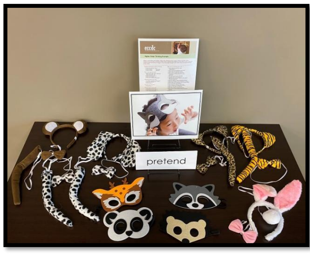
Dress-Up Costumes for Toddlers (Catalogue # 6993 & 6994)