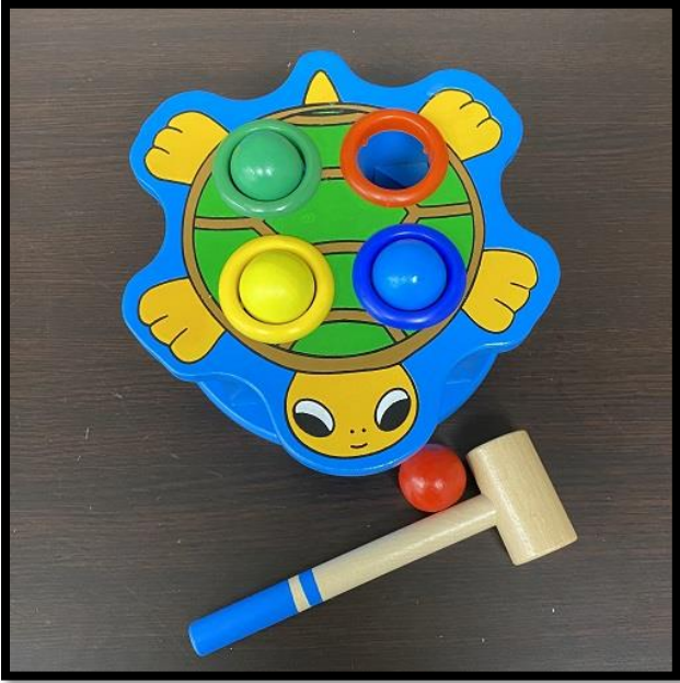
Cause & Effect – Ball Pounding Turtle (Catalogue # 6745)