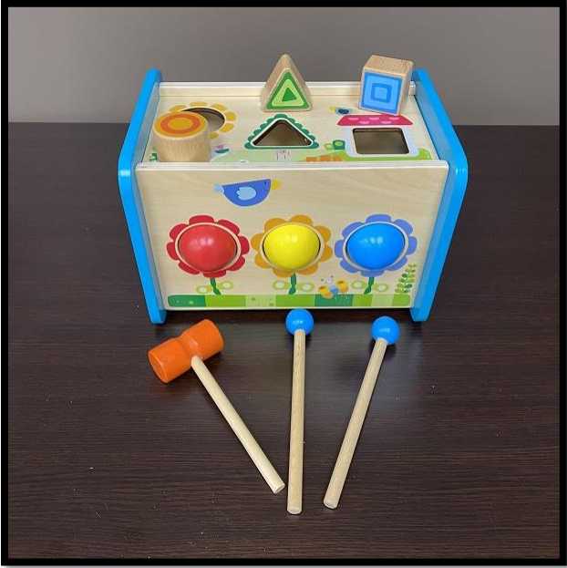
Cause & Effect - Activity Bench (Catalogue # 6746)